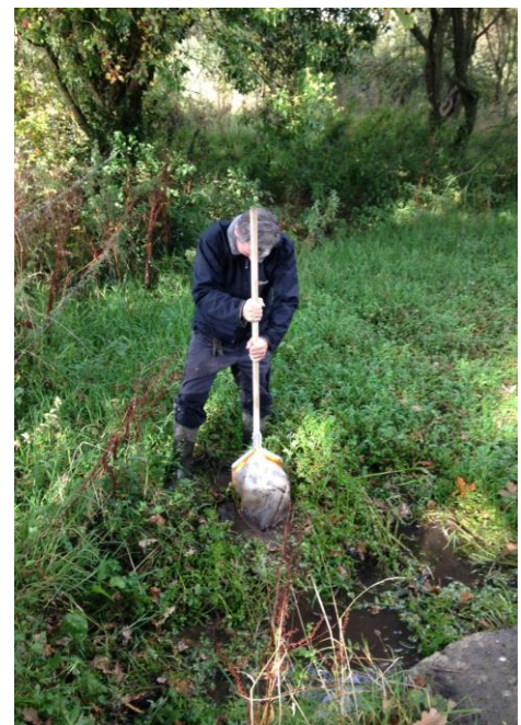
Figure 2 - LYR volunteer kick sampling on the Nedge Brook in Telford

The kick sample should be conducted for three minutes. Where possible, the time should be divided proportionally between the different habitats depending on their abundance. For example, if riffles occupy half (50%) of the site they will be sampled for half of the time (= 90 seconds), and if vegetation occupies a quarter (25%) of the site it will be sampled for a quarter of the time (= 45 seconds).