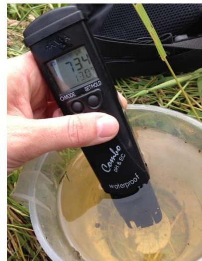
Figure 6 - Combined temperature, pH and conductivity probe

Temperature can be recorded directly from the water body you are monitoring. If there is no safe access to the water, collect a small sample of water using a long pole with a cup on the end or a similar piece of equipment. Insert the temperature probe into the water sample or directly into the water body. Keep the probe tips fully submerged in the water until the read-out on the probe is stable. Temperature is measured in degrees Celsius (°C) or degrees Fahrenheit (°F). Record this value in the record sheet.