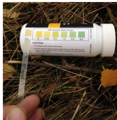
Figure 5 - Matching up the colour of the test strip with the colour coding on the bottle

Allow the test strip to sit for an additional 30 seconds before using the colour chart on the bottle to determine the level of ammonia or nitrate present in the water sample. The amount of ammonia and nitrate is measured in parts per million (ppm). Do this using the individual strips for ammonia and nitrate and record these values on the record sheet.