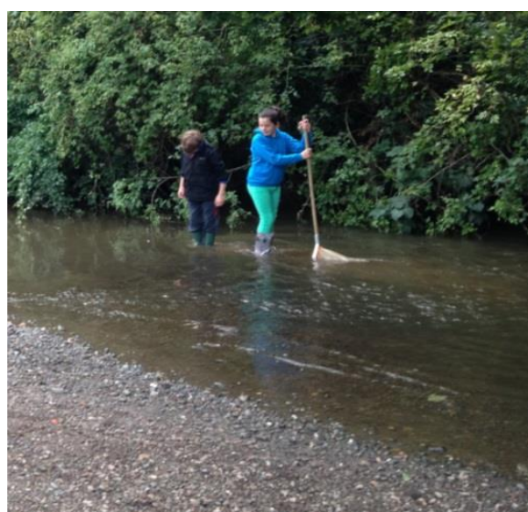
Figure 1 - Volunteers kick sampling on the Reabrook in Shrewsbury

The presence/absence and abundance of certain freshwater invertebrates (often called macroinvertebrates) – the aquatic larval stage of various insects - can tell a story of a water body's health. Because some invertebrates are more sensitive to pollutants than others, we can use them as "indicator species". Assessing the types of invertebrates found indicates something about the health of the water body they have been found in. For example worms can tolerate high levels of pollutants but some mayflies don't tolerate even low levels of pollution. They also help describe when pollution events occur because some populations take a while to recover if they have been harmed by pollution.