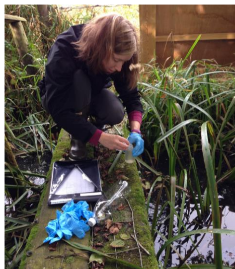
Figure 4 - collecting water samples for further analysis on the War Brook

Regular monitoring can help us understand how the chemistry of the water changes both within a season and between different seasons and therefore how to identify unnatural levels of chemicals.