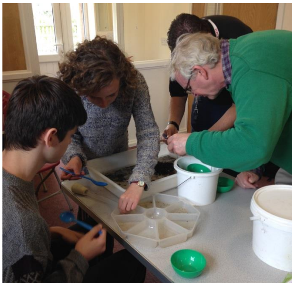
Figure 3 - Volunteers identifying aquatic invertebrates from kick samples

sample or lots of debris, it may be necessary to examine the contents by taking smaller portions at a time. To do this you will need to empty the contents of the net into a bucket half filled with water. Remove a sample from that bucket using a kitchen sieve or similar, and empty the contents into your tray. When you have finished examining the sample, empty the contents into a second bucket or put it back into the river. Continue taking sub-samples until your first bucket is empty.