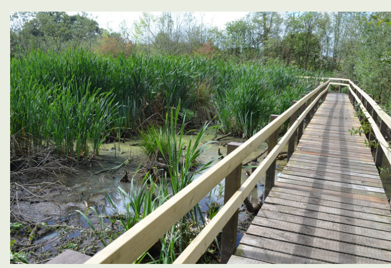
Birch Road Pond.

Other walks can be found here: www.ellesmere.info/things-to-do/walking