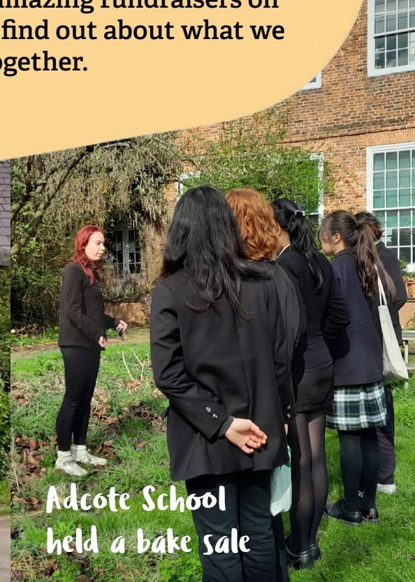
Adcote School held a bake sale