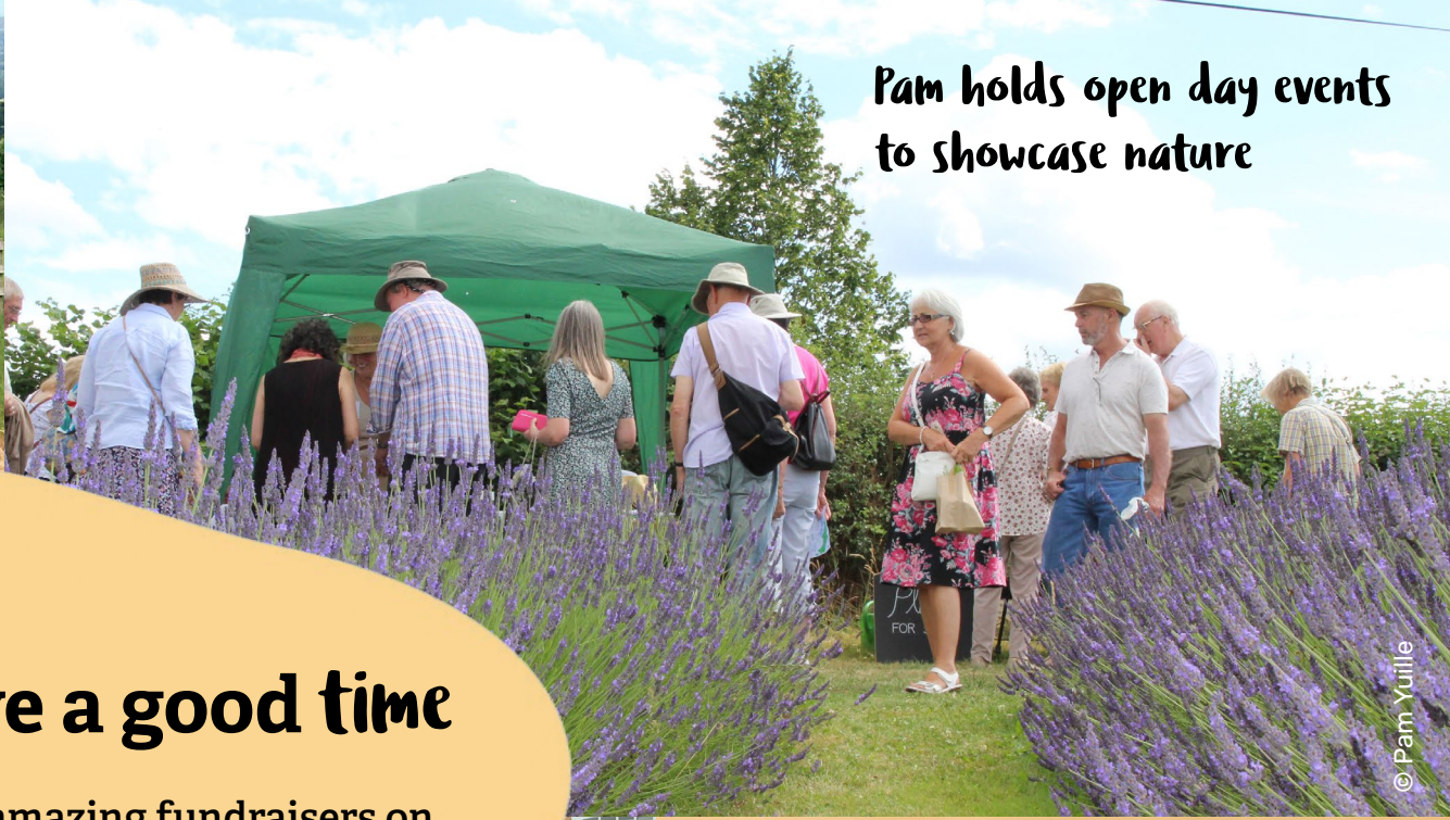
Pam holds open day events to showcase nature

Read about the amazing fundraisers on our website and find out about what we have achieved together.